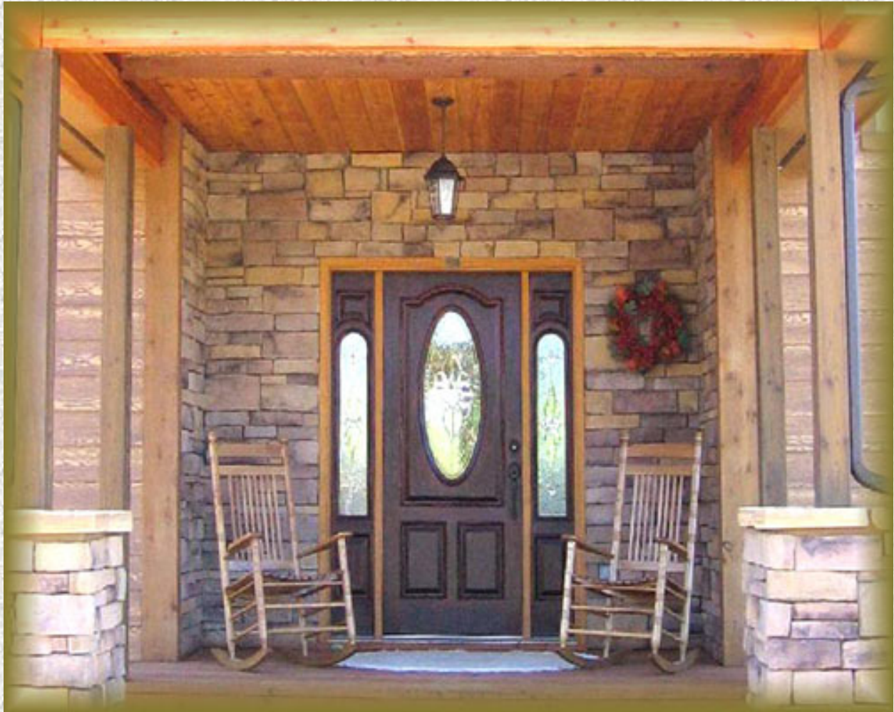
Above: Custom color per client request with a variety of highlight shades.