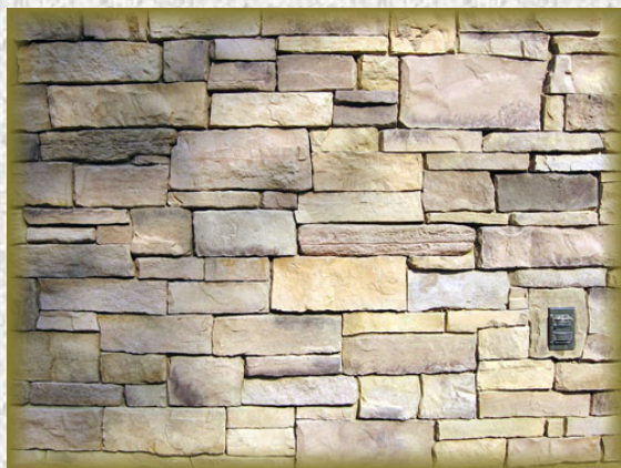
Above & Right: Custom color per client request.